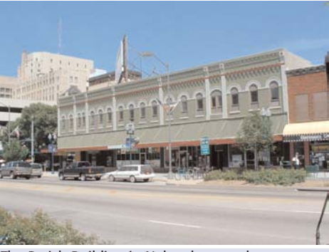
The Parish Building in Nebraska was the Construction Management's project for 2003.

Upon completion of this program, the Construction Management students will receive a Bachelor of Science degree, but the experience from the class gives them so much more. In past years, recommendations made by the students have been incorporated into the owner's actual development plans. Each year this class is taught to over 100 students, and for the past 10 years, the University of Nebraska has had full placement for the